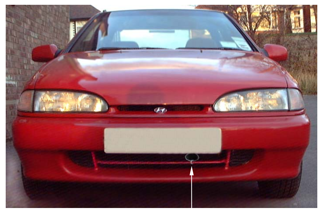
Pierce / Drill a 3mm hole in the end of the flexi cold air hose and feed the hose to the lower grille. Secure the end of the hose to the grille using a plastic tie supplied. It may be necessary to ovalise the end of the hose so that it will fit in the grille.